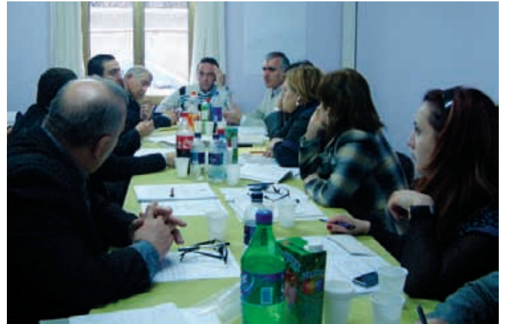
Training session for public defenders on law and health conducted by HCAV, Vanadzor, March 7, 2010.

The training sessions helped define a number of problems existing in the healthcare sector, which were then classified by the rights presented in the European Charter of Patients' Rights. As a follow up activity, it is planned to monitor the situation of patients' human rights in Armenia with the involvement of the trained specialists. The recommendations developed as a result of this monitoring activity will be presented to the Ministry of Healthcare.■