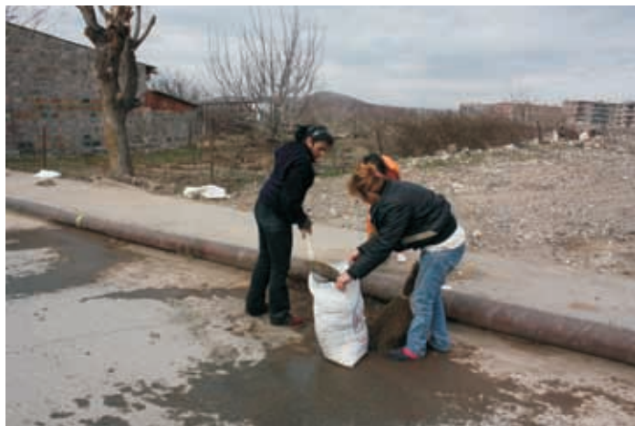
Community Day in Lernagog, March 3, 2010

The Emergency Fund provided $24,500 in assistance to socially vulnerable villagers in Armavir and Aragatsotn marzes for basic nourishment and medication (for more details see the first issue of Activity Highlights , available on http://www.osi.am/newsletters/Nov2009-Jan2010_ENG.pdf ). In Lernagog, the Mayor welcomed the implementation of the project in the village on the condition that the project beneficiaries do something good in their turn to the benefit of the community. The Mayor announced March 3 a Community Day in the village. The beneficiary families came together to clean the village streets. The activity had a snowball effect. Community members not involved in the project joined the beneficiary families to clean their village from garbage. ■