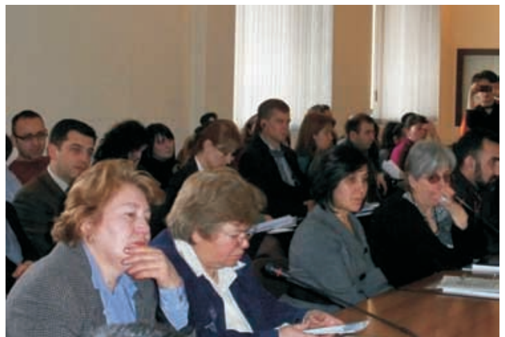
NGOs presenting accomplishments of the three-year program, funded by the foundation and The Netherlands government, February 19, 2010.

The Partnership promoted and supported the ENP process in Armenia since its early stages. This was the third annual report on the country's Action Plan implementation by the Partnership members and experts with the foundation's support. ■