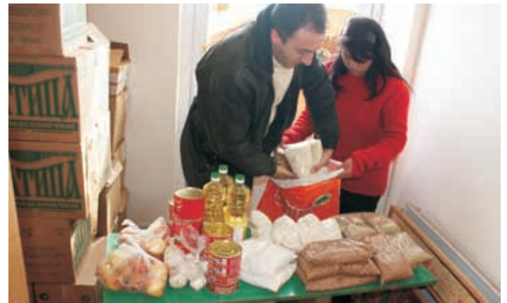
Beneficiaries receiving food in Myasnikyan village, February 2010.