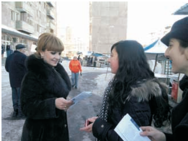
Schoolchildren conducting a survey on children's rights, March 2010.

The foundation acknowledges the importance of European integration and strives to bring the Armenian general education system closer to the European education system through supporting a number of activities such as raising awareness on Europe, its values and structures, history and culture. ■